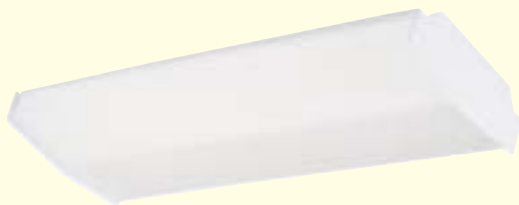
SY 920 220/WRW 220