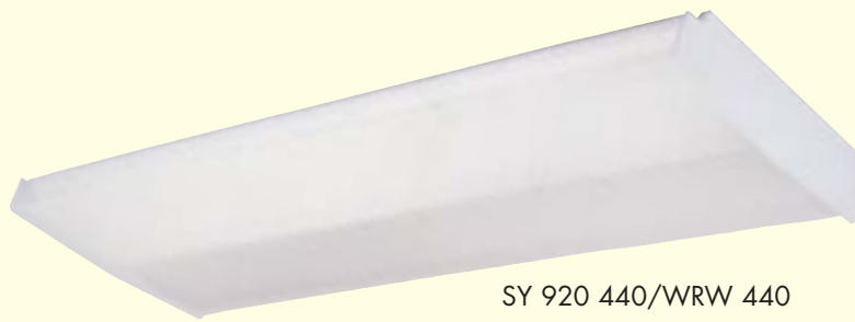
SY 920 440/WRW 440

Available with a glare-reducing diffuser, Wraparounds can be individually or continuous-row mounted. Non-yellowing acrylic prismatic lens keeps the light bright.