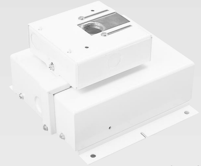
Lamp NOT Included

True-sinusoidal, high frequency, fully dimmable electronic ballast for Pulse Start metal halide lamps. Auto voltage input from 208-277 volts with a no-short, no-fail feature. Potted fabricated heavy duty aluminum housing. Can be remote mounted up to 10 feet. Auto external designed for recessed applications. 3/4" Hook or Pendant Mount options are available.